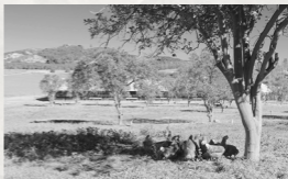
Taking shade in the orange grove on our newest SoCal farm

While our girls are outside eating salad and croutons all day (that's grass and critters to you and I), that's not always enough to keep them laying these beautiful eggs. So while a lot of the goodness that these eggs are packed with (the vitamins, the beta carotene, and more) comes from what they find out on the pasture, there are some vital additional nutrients that we need to provide for them as well.