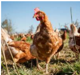
Our girls dine outside all year round, as winter greens replace summer salads.

So the next time you're feeling cooped up and cranky, crack a couple of eggs and add a little heat for a taste of sunshine. Better yet - cook up the baked egg recipe on the next page and invite some friends. Company and comfort food is the best cure for cabin fever.